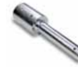
CRA9 Adapter for diameter 31.75 (1.1/4"), 35 and 40 mm shafts.