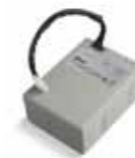
PS124 24 V battery with integrated battery charger.